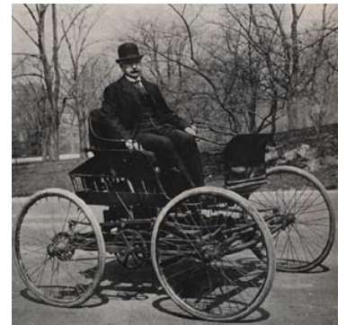
Early Automobile

My Grandfather was born exactly 100 years ago. I remember him telling me that he and his friends used to watch in amazement as early automobiles passed horse-drawn carriages. He was always interested in technology, sometimes wondering if men would ever make it to the Moon, and if they did, what creatures might live there, or even if there might be men who already lived there.