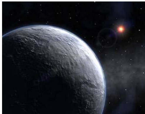
Exoplanet artwork - ESO

Mankind is in the midst of yet another fundamental change in its perception of the Universe. Scientists and others interested in astronomy are understandably excited about the discovery of numerous worlds around other stars, but few others outside the astronomical community understand the implications of the discovery. The Universe is populated with a great multitude of planets! The variety of these bodies appears to be unbounded. Their sizes and orbits have been unexpected and will one day lead to a definitive understanding of the process by which planetary systems are formed.