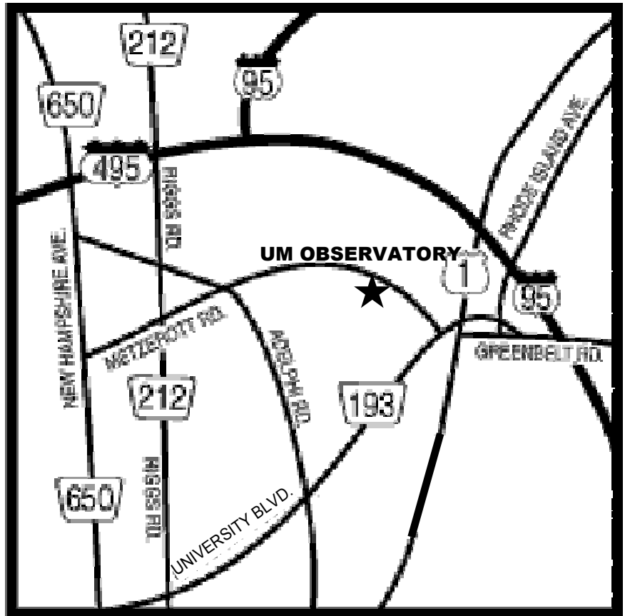
Getting to the NCA Meeting

At 5:30 p.m., before the meeting, please join us for dinner at the Garden Restaurant in the UMD University College Inn and Conference Center, 3501 University Blvd. East at Adelphi Rd. From the Beltway, either take New Hampshire Ave. south, turn left onto Adelphi, and at the third light (passing Metzerott) turn left onto University then immediately right into the garage; or, take US-1 south, turn right onto University Blvd. west, and take it to the intersection with Adelphi Rd. Park either in the garage (costs), or in Lot 1 nearby (free). To get to the Observatory, exit to the right onto University Blvd. (MD-193) east, and at the second light turn left onto Metzerott Rd.